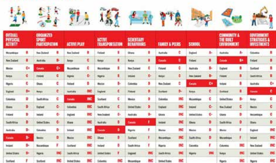
Source: Active Healthy Kids Canada (2014). Is Canada in the Running? The 2014 Active Healthy Kids Canada Report Card on Physical Activity for Children and Youth . Toronto: Active Healthy Kids Canada.

In 2014, 15 countries released a Report Card on Physical Activity for Children and Youth based on the Active Healthy Kids Canada Model. Here are the results: